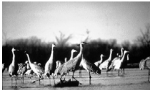
Nebraska Sandhill Cranes

The course will include lectures, discussion and educational activities. Course fees includes lunch, breaks and materials.