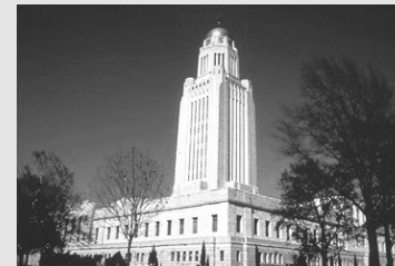
Nebraska State Capitol