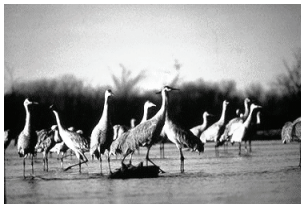
Nebraska Sandhill Cranes