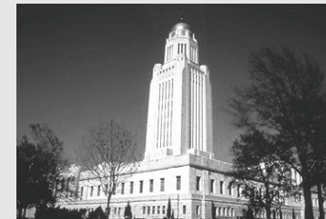
Nebraska State Capitol